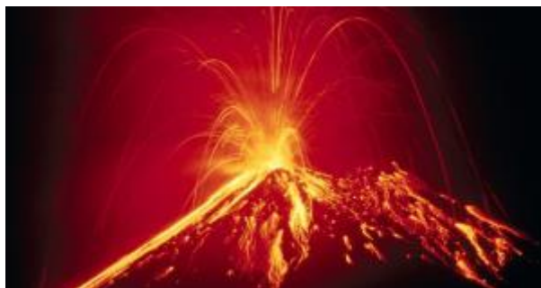
3 - We had great fun trying out this experiment and we are definitely going to try it again on a bigger scale, maybe with papier machet or just lots of stones and a giant bottle!

Stay tuned and see what we get up to next Forest Friday!